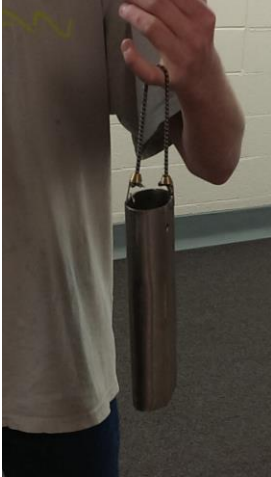
Steel from a tail pipe and a bungee cord