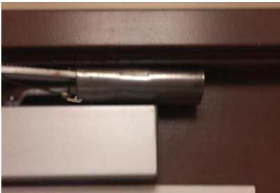
Slip over door closer and attach bungee cord to joint.